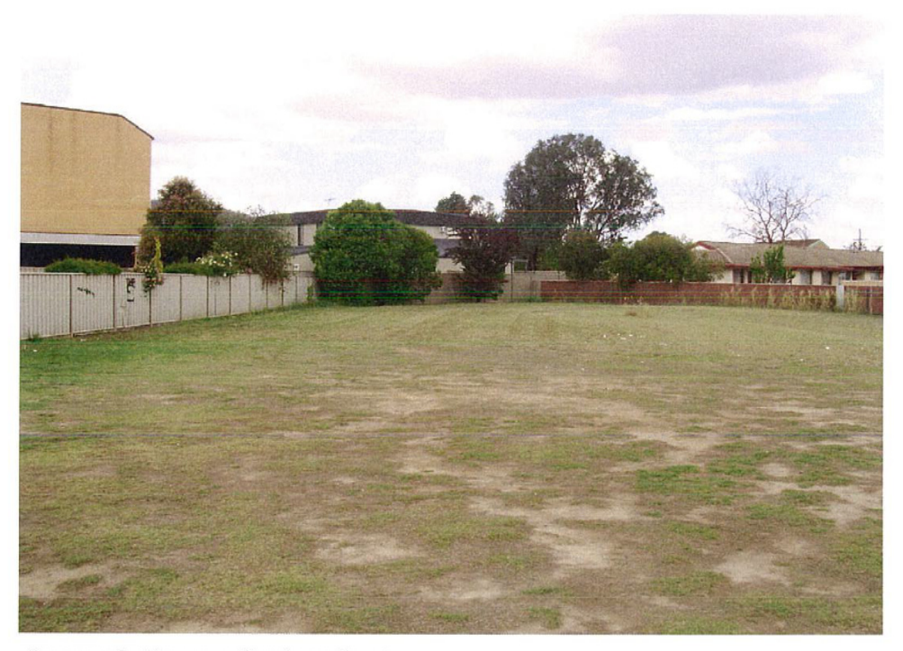
Community Reserve, Kambora Court