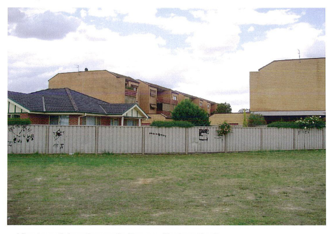
View to north from Community Reserve, Kambora Courtr