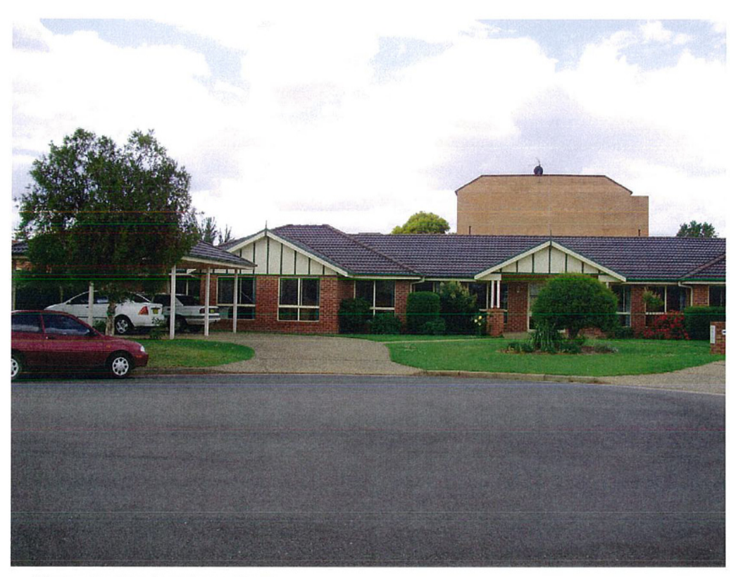
Mercy Centre, Kambora Court