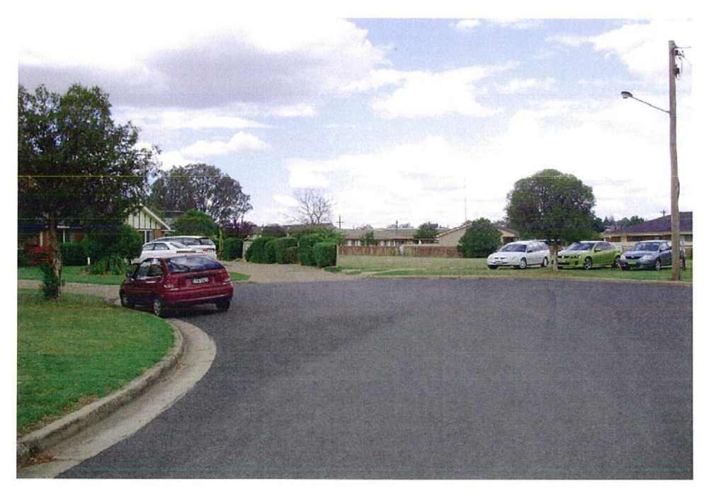
L to R: 12 Kambora Court (Mercy Centre), Community Reserve, 11 Kambora Court (with carparking)